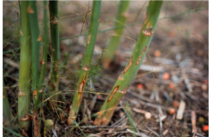
Purple spot on asparagus stems.

Purple spot disease was named for the sunken, purple, oval-shaped lesions that develop on asparagus spears. During seasons that experience heavy disease