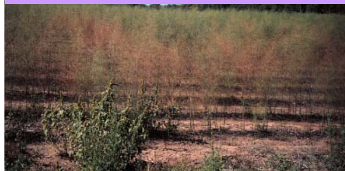
Asparagus field with severe purple spot disease.