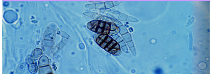
Conidia of Stemphylium vesicarium .