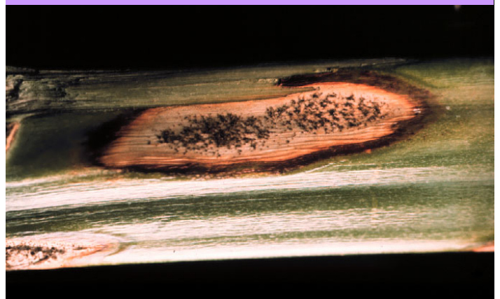
Purple spot lesion with visible spore production.