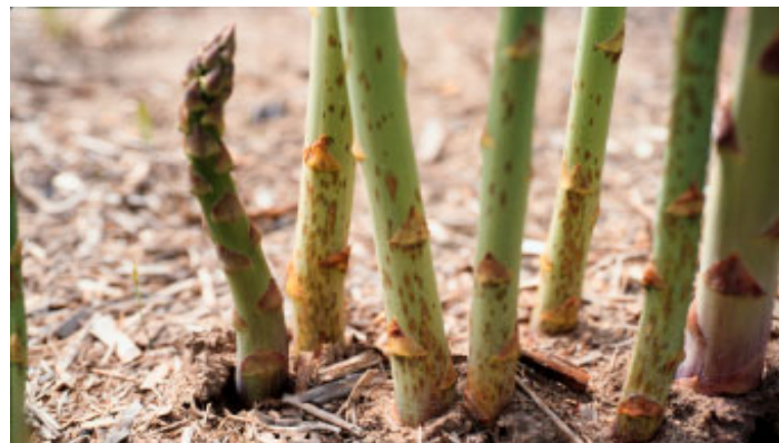
Asparagus spears with purple spot.

The FRAC code is an alphanumeric code assigned by the Fungicide Resistance Action Committee and is based on the mode of action of the active ingredient. When treating for purple spot, rotate among products with different FRAC codes to reduce the possibility of resistance developing in the purple spot fungus.